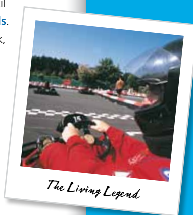
The Living Legend

Turn left at the shop, then right following the Beaumont Perqotage by the stream. Cross the main road onto the cycle track to end this tour; turn left towards St Helier or right to St Aubin.